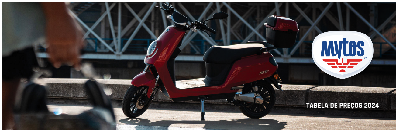
TABELA DE PREÇOS 2024